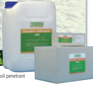
Contains polyoxyalkylene glycol surfactants and soil penetrant

A range of Complete Immersion Technology wetting agents for the treatment of Dry Patch and other water-related problems in turfgrass