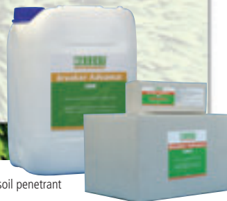
Contains polyoxyalkylene glycol surfactants and soil penetrant

A range of Complete Immersion Technology wetting agents for the treatment of Dry Patch and other water-related problems in turfgrass