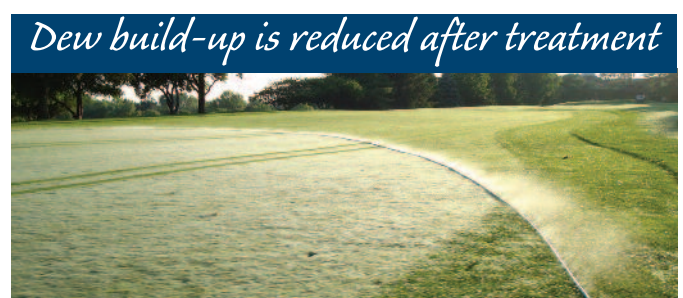
Dew build-up is reduced after treatment

Apply as a medium/coarse spray as recommended by the BCPC system. Always check manufacturer tables for current nozzle choices before applying the product.