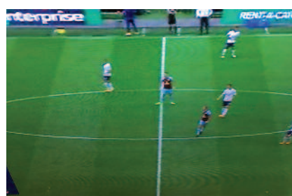
After 24 hours logo is now invisible