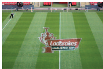
Logo and lines highly visual using Wipe-Out paint

* Wipe-Out S is not water soluble and will need to be removed using Duraline Dissolving Solution