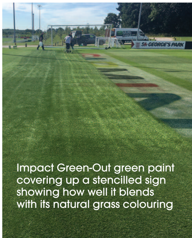
Impact Green-Out green paint covering up a stencilled sign showing how well it blends with its natural grass colouring